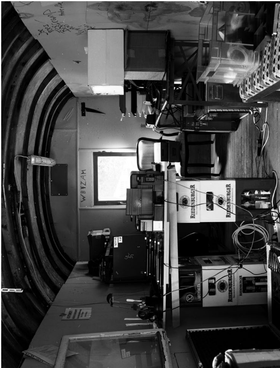
INT. WAR ROOM - NIGHT - 02:32 a.m.